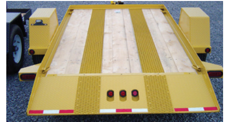
Forklift Tread Package (optional)