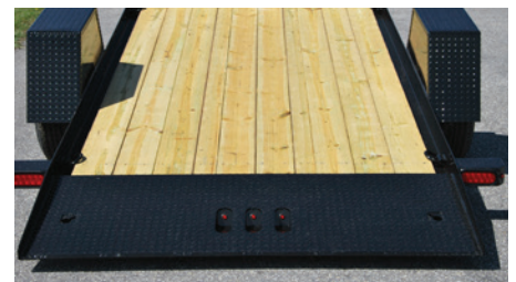
Approach Plate w/(2) Banjo Eye Tie-Downs