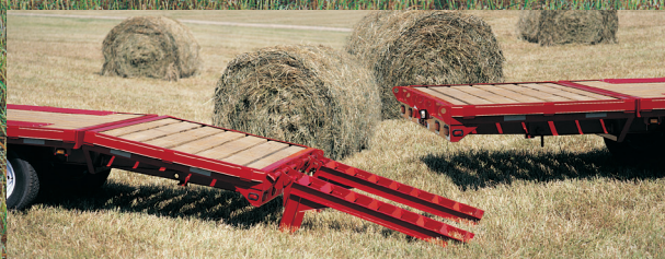
ADJUSTABLE DOVETAIL Easily convert the dovetail to lay flat with the deck of the trailer providing additional hauling space.