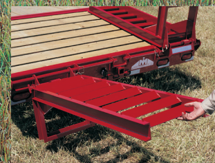
SPRING LOADED RAMPS Spring loaded ramps lift easily, but are built tough with heavy-duty 4" channel.