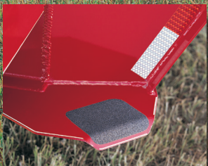
INTEGRATED STEPS Steps on both sides of the trailer allow for easy access to the deck.

Moritz trailers are sold exclusively through an Authorized Dealer Network. For dealer information, call us at (419) 526-5222 or visit our website at www.moritzint.com .