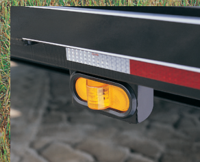
SIDE TURN SIGNALS Mid-trailer side turn signals are standard on all Moritz F-Series trailers.