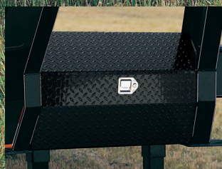
STANDARD TOOLBOX Built with diamond plate steel- all models.