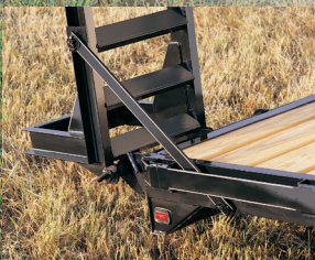
VERTICAL RAMP BARS Our optional vertical ramp bars give you additional hauling space.