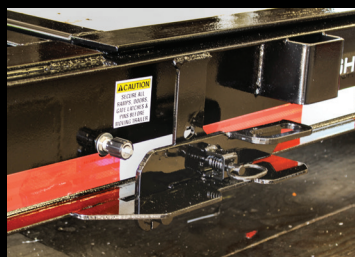
Tilt Latch & Cylinder Shut Off Valve