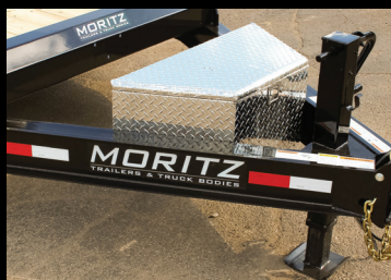
Aluminum Tool Box