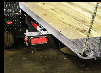
Rear Corner Tie Down