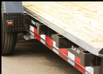
Heavy Duty 4" x 1/4" Bar Stake Pockets