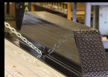
Tie Down Between Fenders (flush w/deck & fenders)