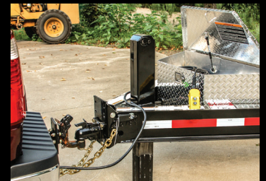
Optional Hydraulic Jack