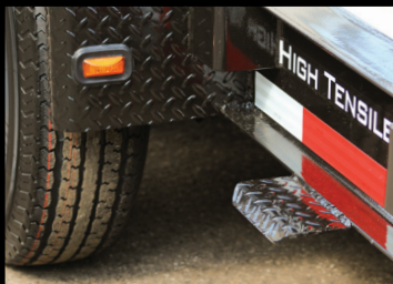
Step To Access Deck