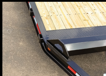
Cold Formed 8" I Beam