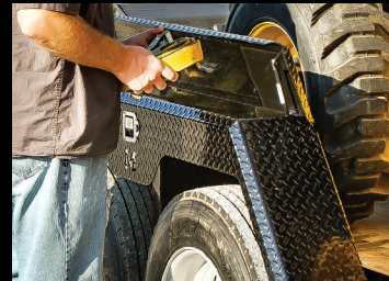
Optional Fender Tool Boxes (ratchet boomer storage)