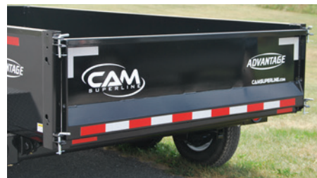
2-Way Tailgate (standard)