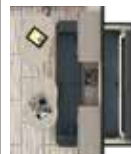
Optional Slide-Out w/Couch Bed Size 36" x 59"