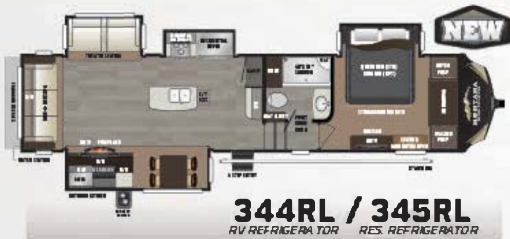
344RL / 345RL RV REFRIGERATOR RES. REFRIGERATOR