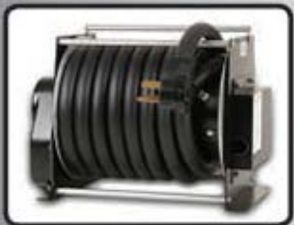
SHORELINE POWER CORD REEL (N/A 3000RLE)