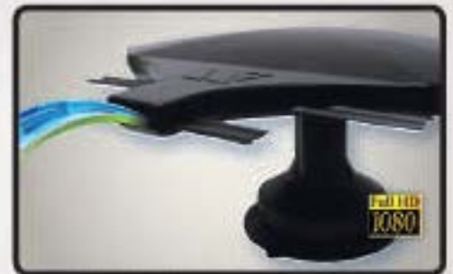
WINEGARD RAYZAR Z-1 TV ANTENNA