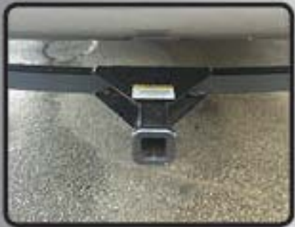
REAR ACCESSORY HITCH