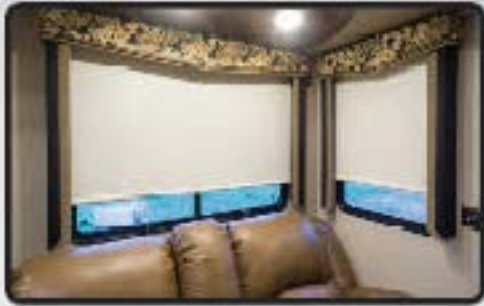
UPGRADE ROLLER SHADES