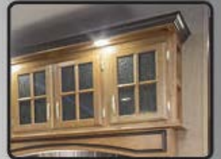
HARDWOOD CHERRY CABINET FRAMING (STILES)