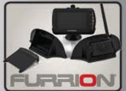
WIRELESS REAR VIEW CAMERA SYSTEM