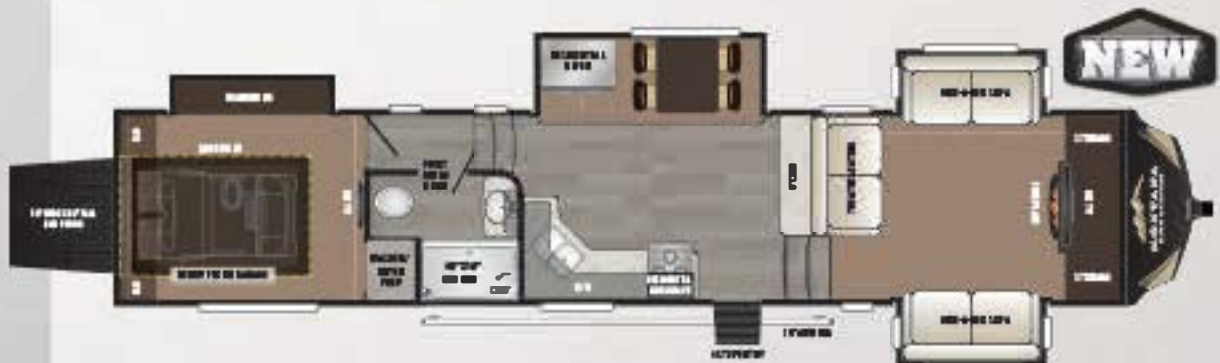
380TH / 381TH