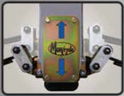
EXCLUSIVE MOR/RYDE 4100 SUSPENSION SYSTEM W/ WET BOLTS