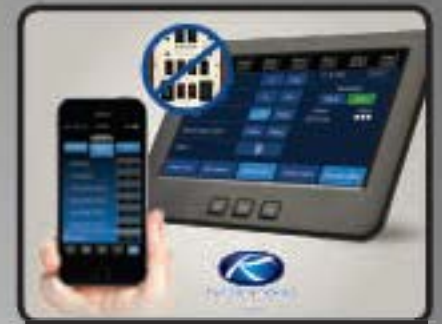
iN-COMMAND CONTROL SYSTEM