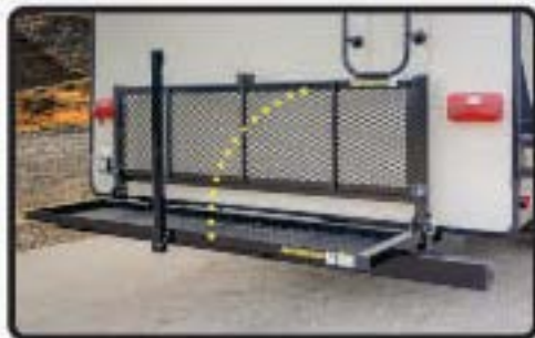
TAILGATE BIKE RACK