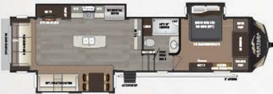
352RL / 353RL RV REFRIGERATOR RES. REFRIGERATOR