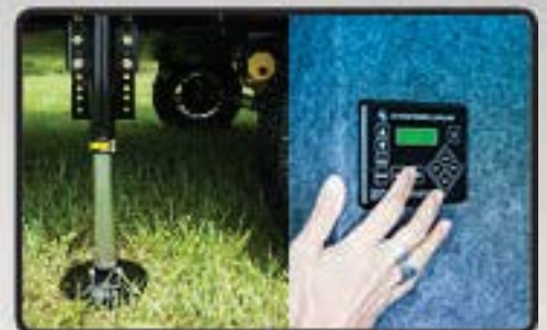
AUTO LEVELING SYSTEM