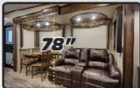
78" TALL MAIN SLIDE-OUTS W/ PANORAMIC WINDOWS