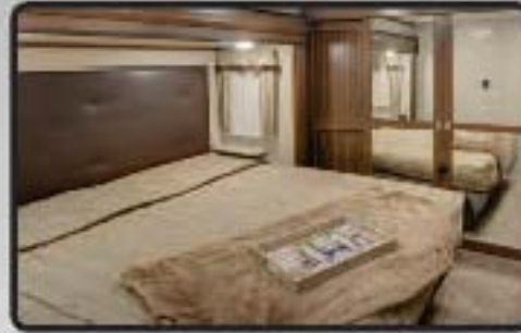
KING SIZE BED (N/A 362RD, 380Q/381TH)