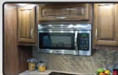
TRUE 30" RESIDENTIAL MICROWAVE