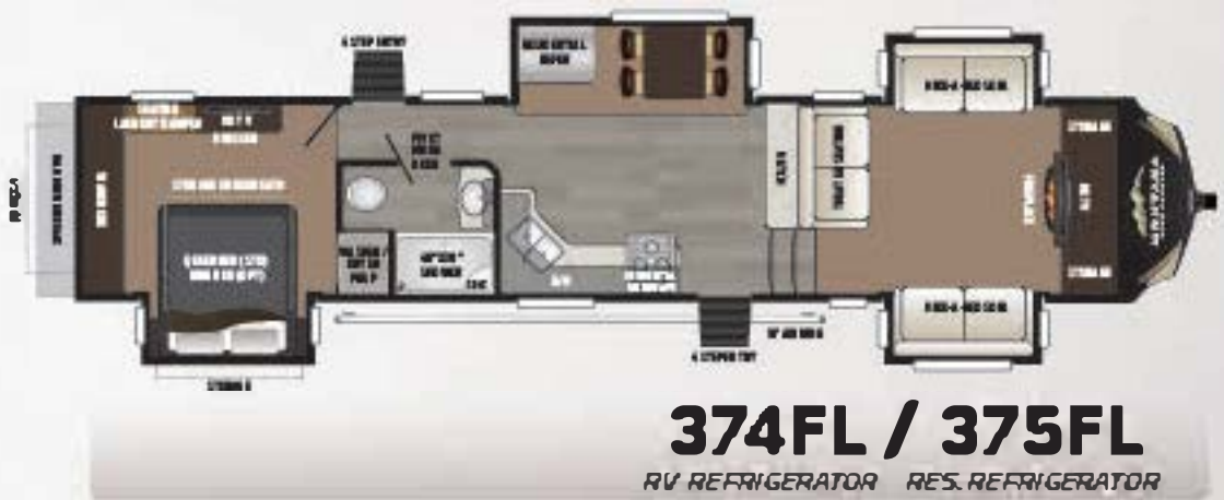
374FL / 375FL