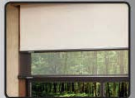
UPGRADE DAY/NIGHT ROLLER SHADES (LIVING ROOM ONLY)