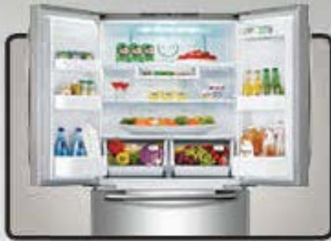
18 CUB. FT. RESIDENTIAL REFRIGERATOR W/ ICE MAKER (345RL, 353RL, 375FL, 378RD)