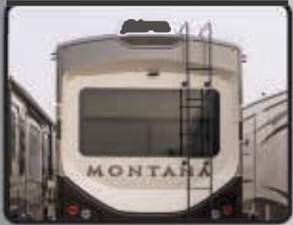
DECORATIVE FIBERGLASS REAR CAP (N/A 3790, 3791)