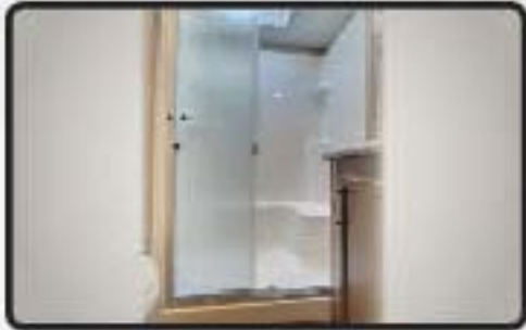
SEAMLESS 48"X30" FIBERGLASS SHOWER W/ SEAT