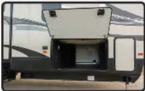
DROP FRAME CONSTRUCTION WITH MASSIVE STORAGE