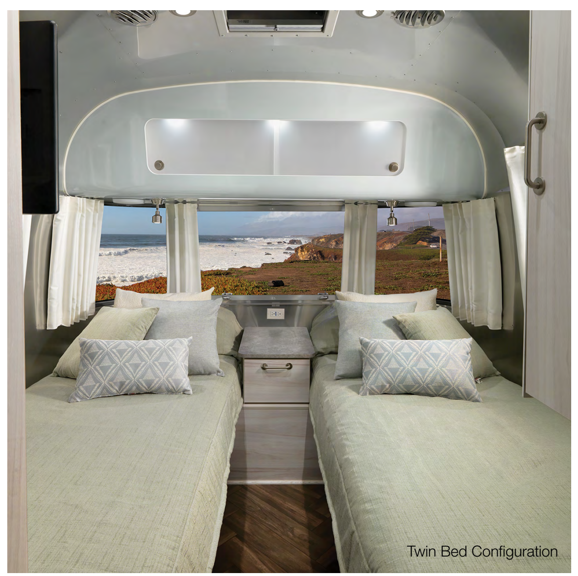
Choice of Either Queen or Twin Beds