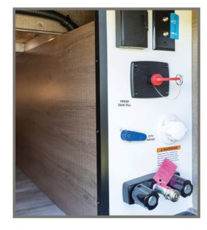
UNIVERSAL DOCKING STATION All-in-one location for utilities and hookups.