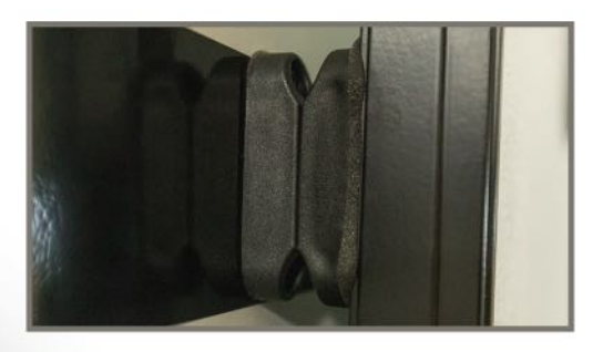
MAGNETIC STORAGE DOOR CATCHES