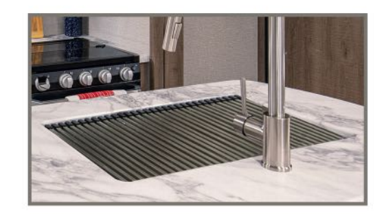
DEEP SEATED STAINLESS STEEL SINK WITH COVER