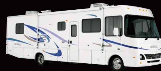
Deluxe Graphics Package (Standard)

DayBreak's exterior has a wonderfully fluid, sweeping look, with bold, clean graphics and optional paint styles. Few other motorhomes in DayBreak's class offer this many choices.