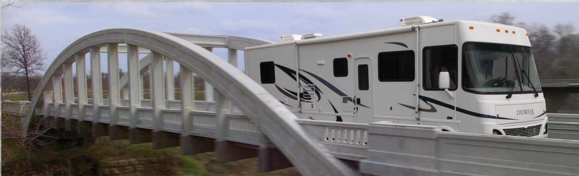
Bush Creek Arch Bridge. Baxter Springs, Kansas

You've just found the most motorhome for the money. DayBreak.