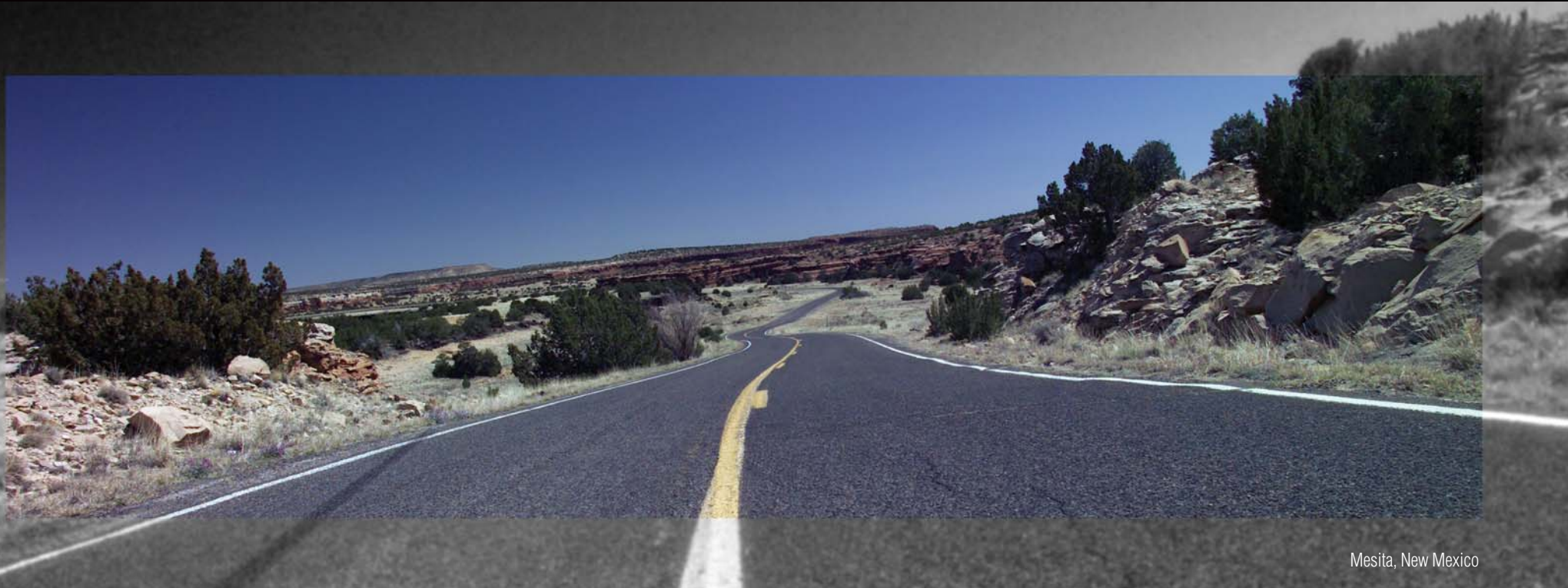
Mesita, New Mexico