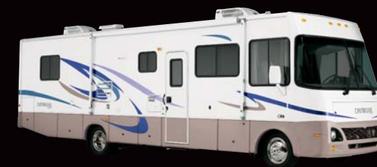
Briar Brown Paint Package (Optional)