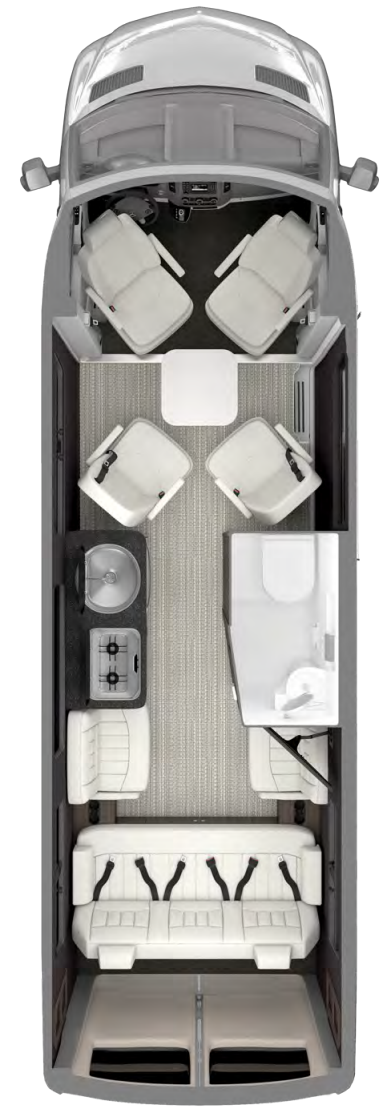
Interstate 24GL 4x4