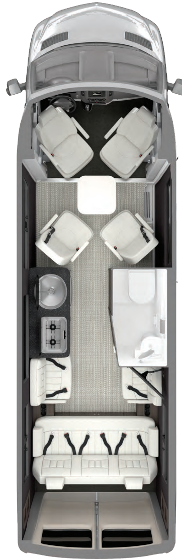
Interstate 24GL 4x2

In the Interstate 24GL, the fun doesn't have to wait to begin until you arrive at your destination, the fun begins the moment you step inside.