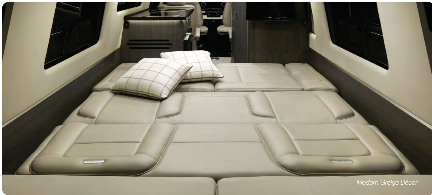
Modern Greige Décor