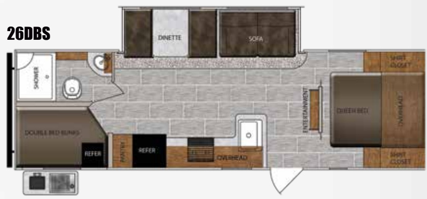
Length: 31' 1" • Height: 10' 7" • Hitch Weight: 555 lb. Unloaded Vehicle Weight (UVW): 5,528 lb. • Cargo Carrying Capacity (CCC): 2,027 lb.