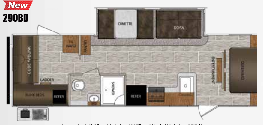
Length: 34' 6" • Height: 10' 7" • Hitch Weight: 655 lb. Unloaded Vehicle Weight (UVW): 6,288 lb. • Cargo Carrying Capacity (CCC): 1,367 lb.