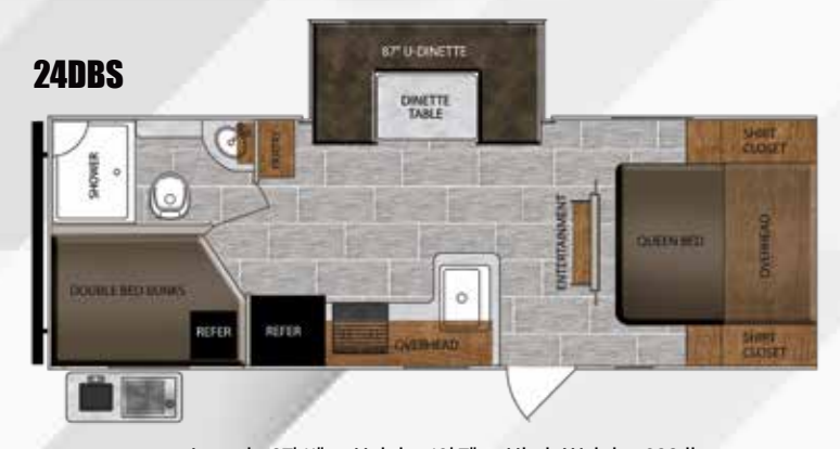
Length: 27' 11" • Height: 10' 7" • Hitch Weight: 629 lb. Unloaded Vehicle Weight (UVW): 5,248 lb. • Cargo Carrying Capacity (CCC): 2,381 lb.