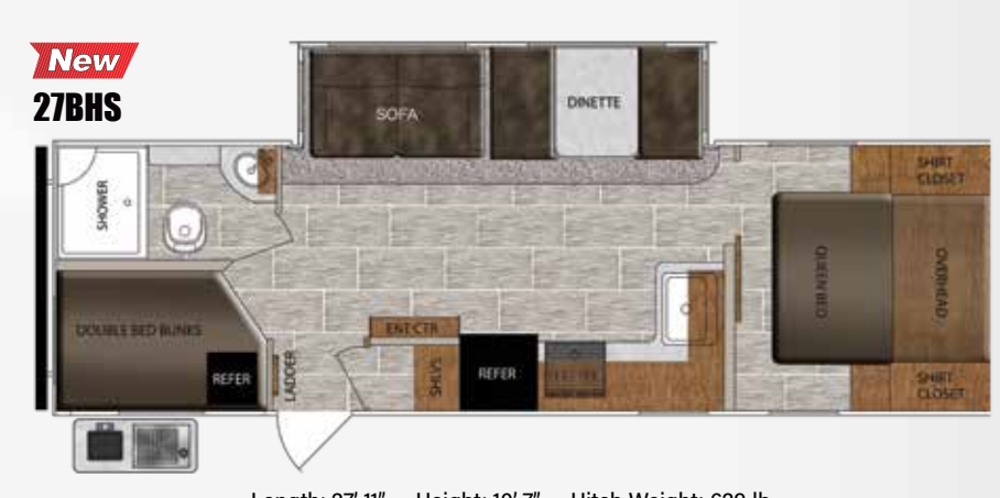
Length: 27' 11" • Height: 10' 7" • Hitch Weight: 629 lb. Unloaded Vehicle Weight (UVW): 5,248 lb. • Cargo Carrying Capacity (CCC): 2,381 lb.