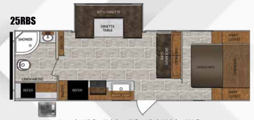
Length: 29' 1" • Height: 10' 7" • Hitch Weight: 550 lb. Unloaded Vehicle Weight (UVW): 4,948 lb. • Cargo Carrying Capacity (CCC): 2,602 lb.