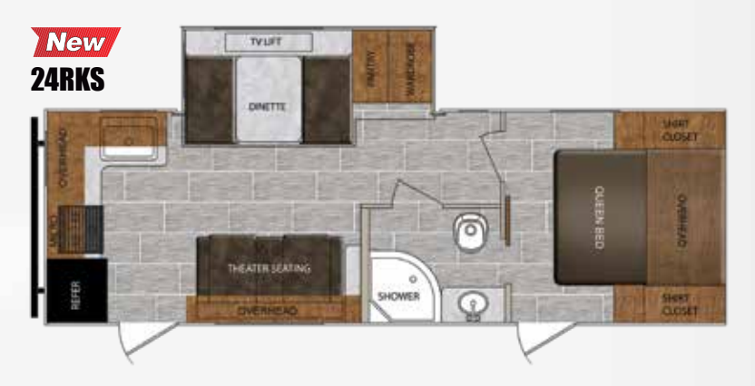
Length: 28' 11" • Height: 10' 7" • Hitch Weight: 550 lb. Unloaded Vehicle Weight (UVW): 5,338 lb. • Cargo Carrying Capacity (CCC): 2,212 lb.