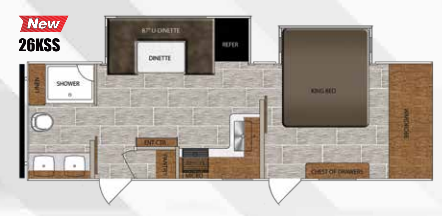
Length: 30' 11" • Height: 10' 7" • Hitch Weight: 760 lb. Unloaded Vehicle Weight (UVW): 6,143 lb. • Cargo Carrying Capacity (CCC): 1,617 lb.