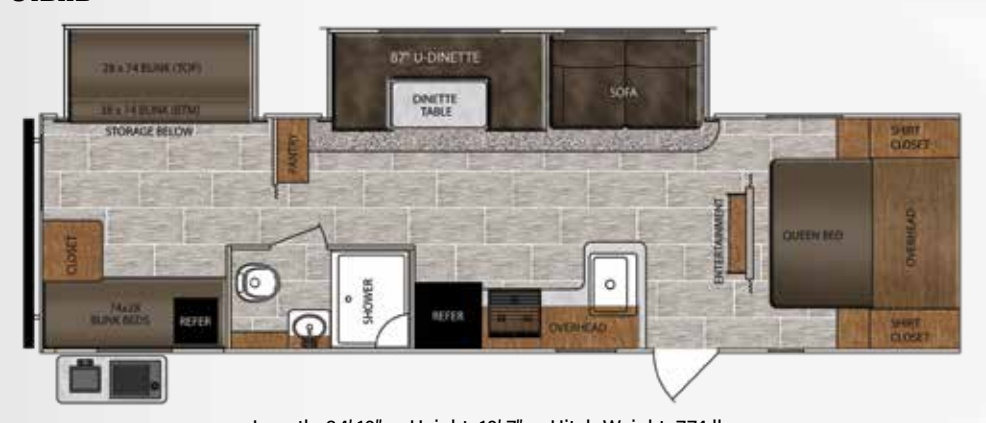
Length: 34' 10" • Height: 10' 7" • Hitch Weight: 774 lb. Unloaded Vehicle Weight (UVW): 6,648 lb. • Cargo Carrying Capacity (CCC): 1,126 lb.